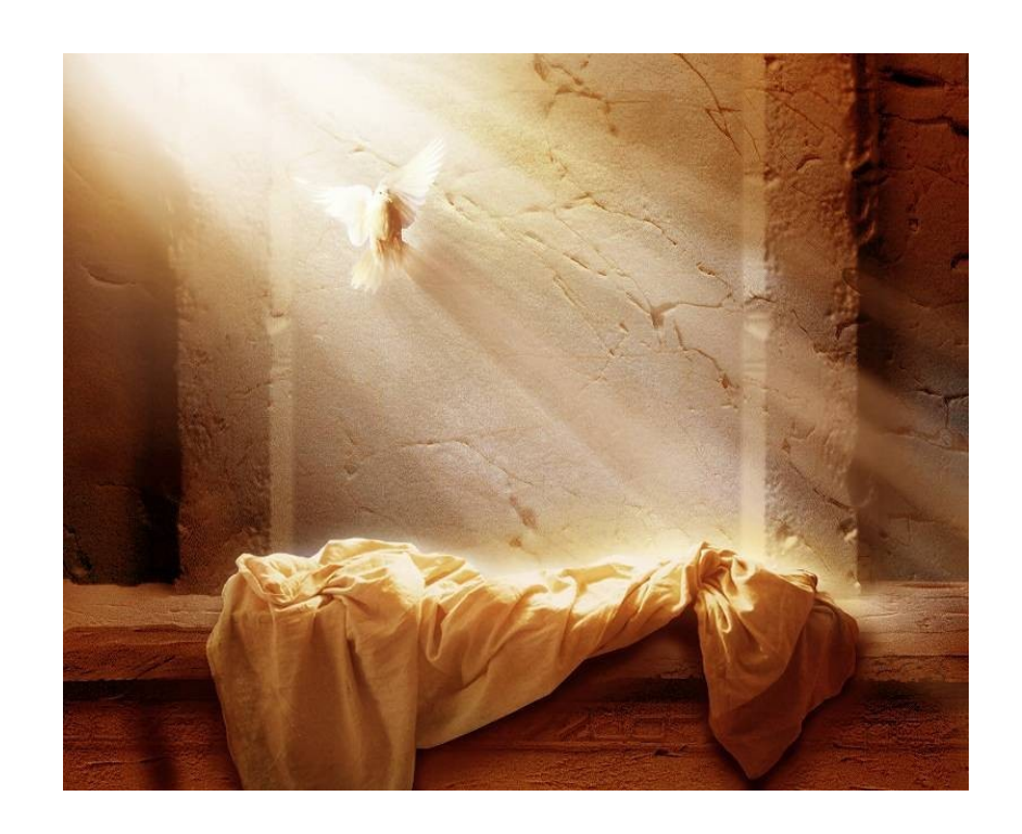
Easter Day The Resurrection of Our Lord April 20th, 2025 8:30 am

YouTube: Good Shepherd Lutheran Church Berwick