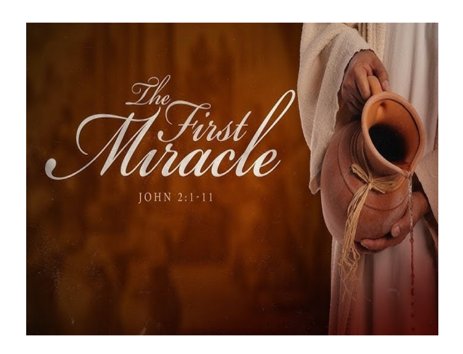
Second Sunday after Epiphany January 19, 2025

YouTube: Good Shepherd Lutheran Church Berwick